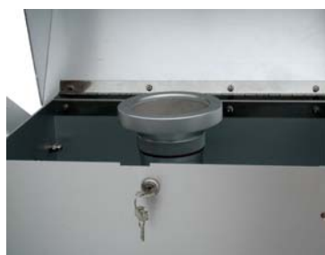
Cabinet's lock details

Echo HiVol is equipped with a three stages brushless blower, practically maintenance free, and its averaged life is higher than 20000 hours (more than 2 non-stop operating years).