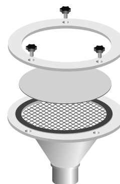
Filter holder for TSP collection detail